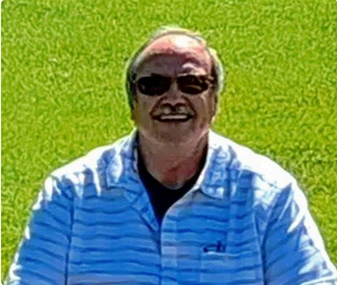
The picture we received when we arrived in Michigan 8/3/22