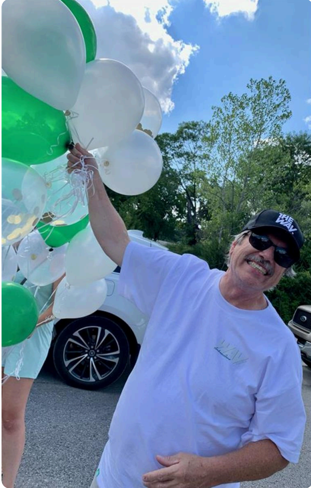
Kansas City 2022